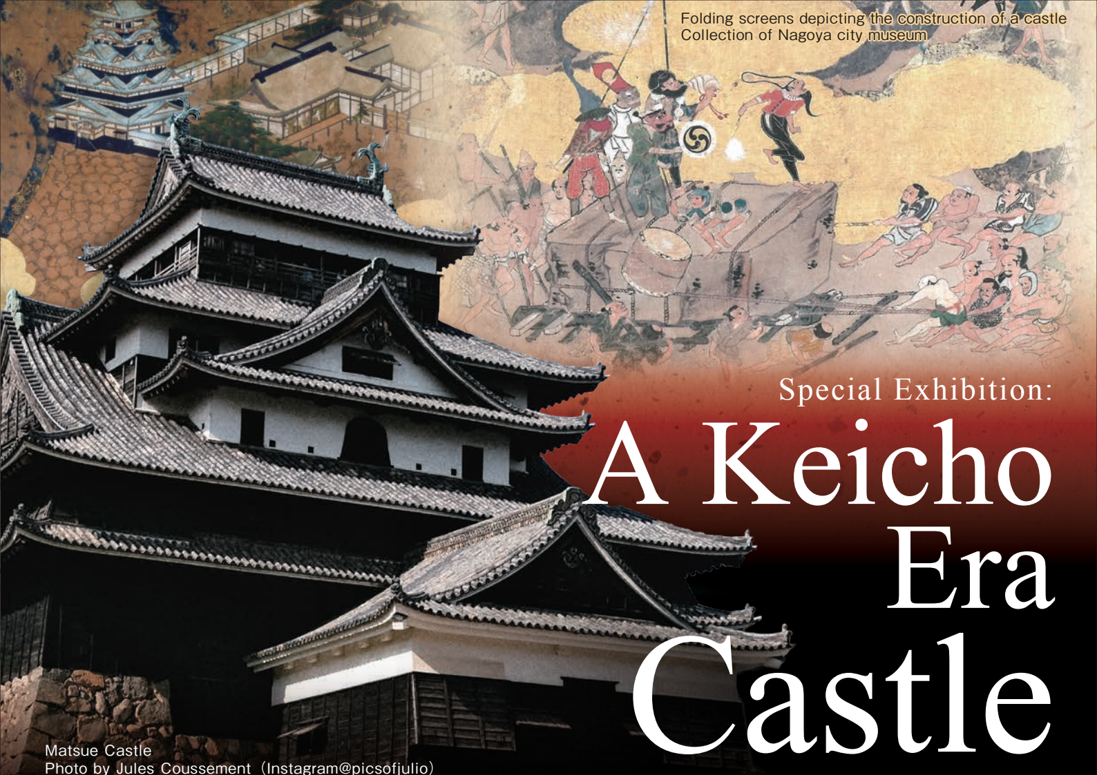
Matsue Castle